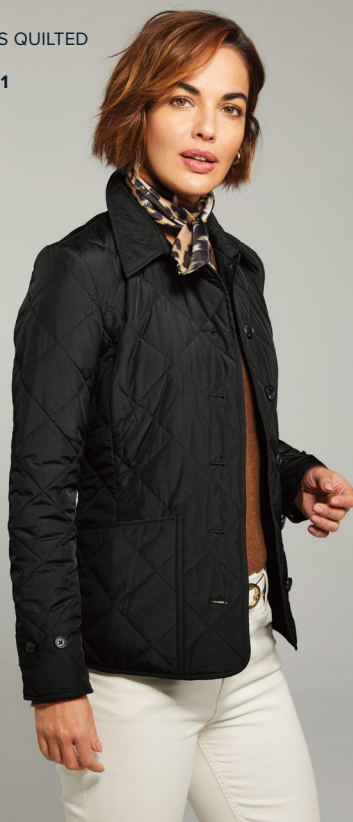
WOMEN'S QUILTED JACKET BB18601