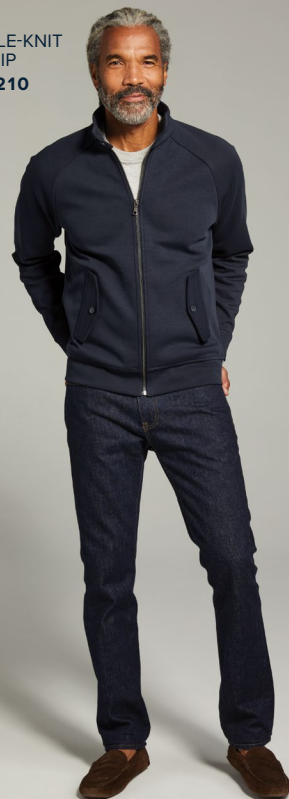
DOUBLE-KNIT FULL-ZIP BB18210