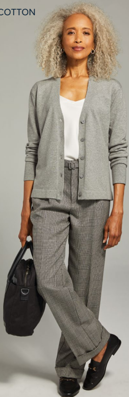
WOMEN'S COTTON STRETCH CARDIGAN SWEATER BB18405