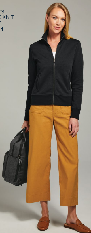
WOMEN'S DOUBLE-KNIT FULL-ZIP BB18211