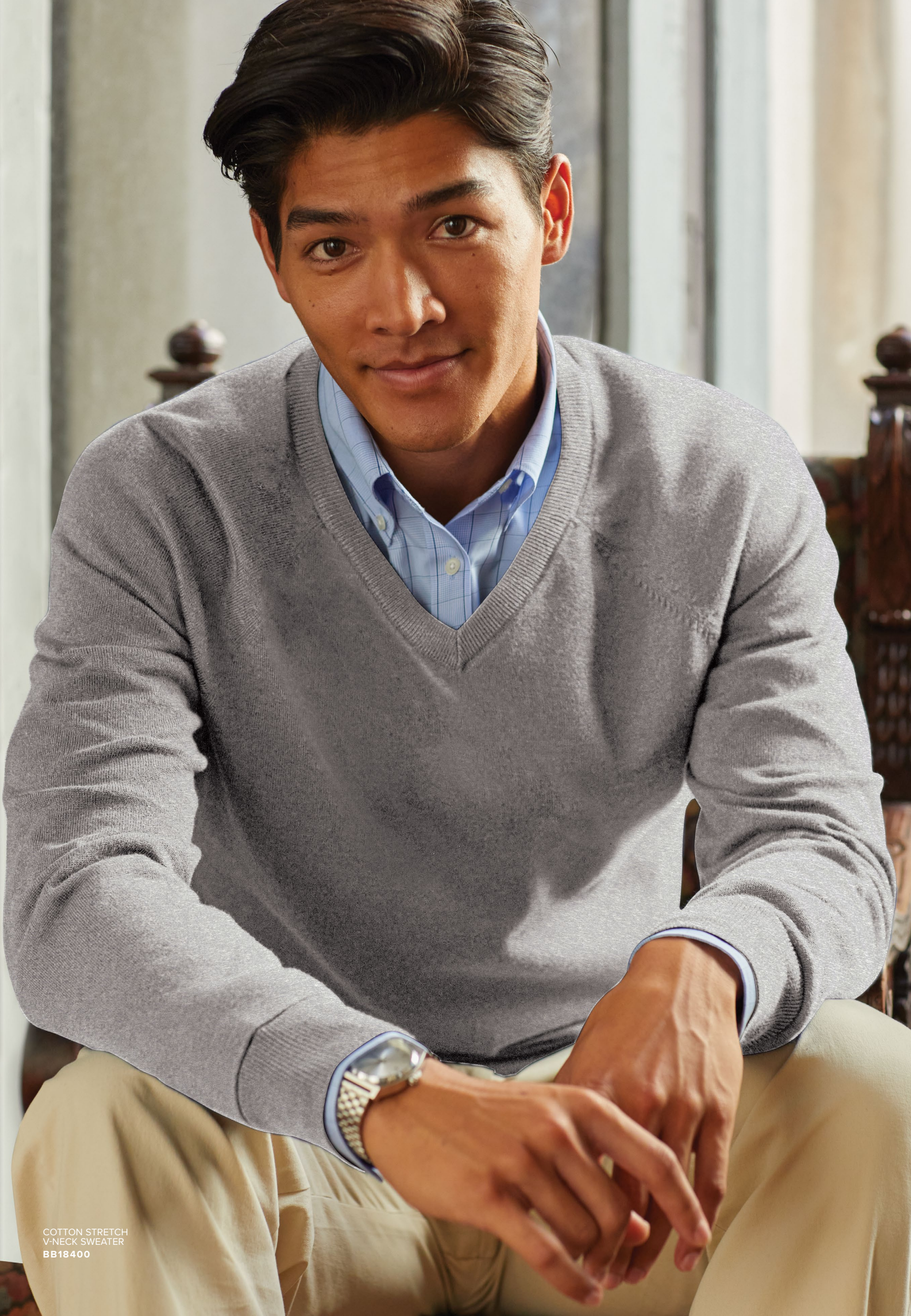
COTTON STRETCH V-NECK SWEATER BB18400