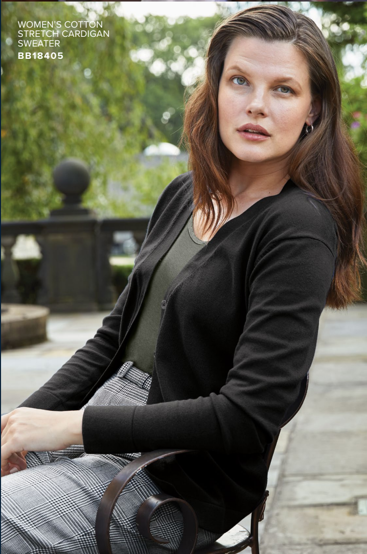
WOMEN'S COTTON STRETCH CARDIGAN SWEATER BB18405