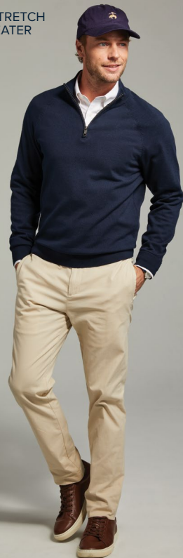
COTTON STRETCH 1/4-ZIP SWEATER BB18402