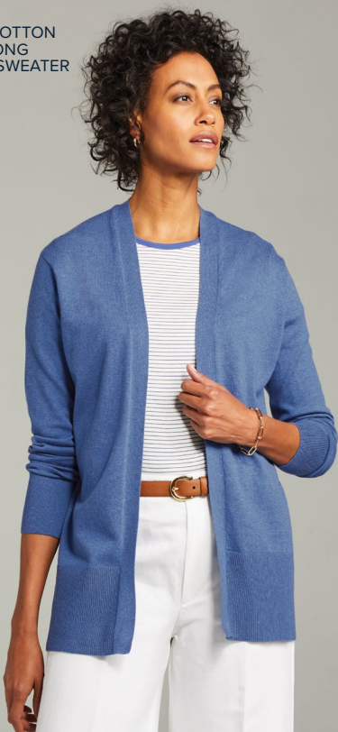
WOMEN'S COTTON STRETCH LONG CARDIGAN SWEATER BB18403