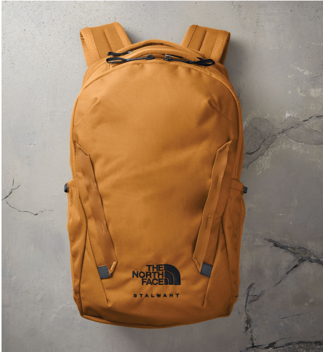
The North Face® Stalwart Backpack NFOA52S6 | 3 colors