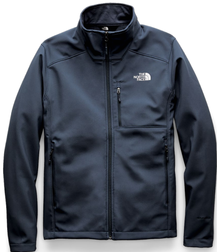
The North Face® Apex Barrier Soft Shell Jacket NFOA3LGT Adult Sizes: S-3XL 4 Colors