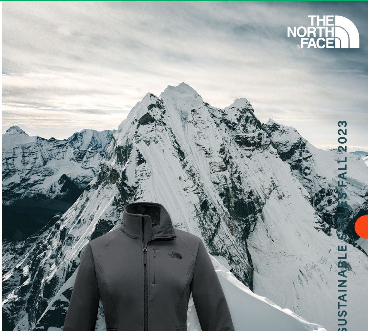
The North Face® Ladies Apex Barrier Soft Shell Jacket NFOA3LGU Ladies Sizes: S-2XL 3 Colors