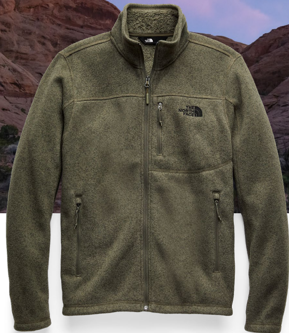
The North Face® Sweater Fleece Jacket NFOA3LH7 Adult Sizes: S-3XL 4 Colors