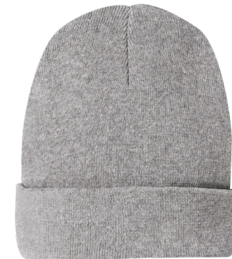
District® Re-Beanie™ DT815 | One Size Fits Most | 4 colors