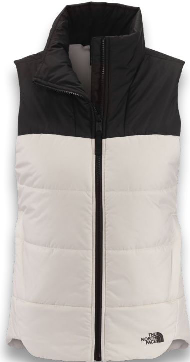
The North Face® Ladies Everyday Insulated Vest NFOA529Q | Ladies Sizes: S-2XL | 2 colors