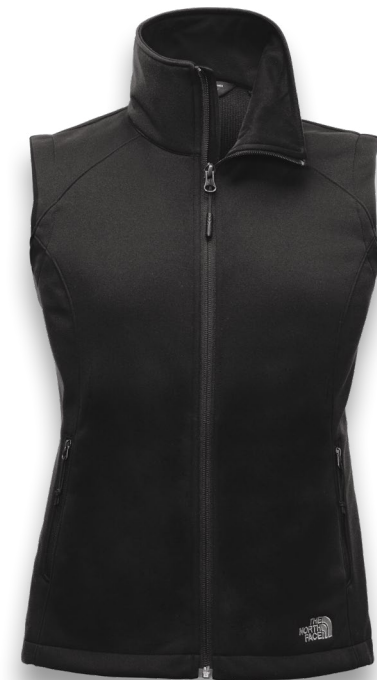
The North Face® Ladies Ridgewall Soft Shell Vest NFOA3LH1 Ladies Sizes: S-2XL 2 colors