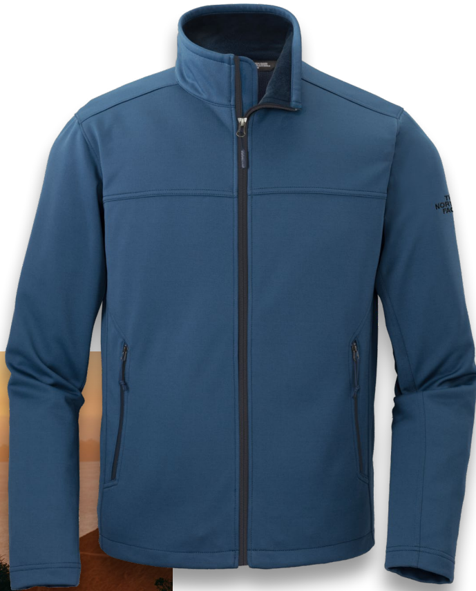
The North Face® Ridgewall Soft Shell Jacket NFOA3LGX | Adult Sizes: S-3XL | 5 colors*