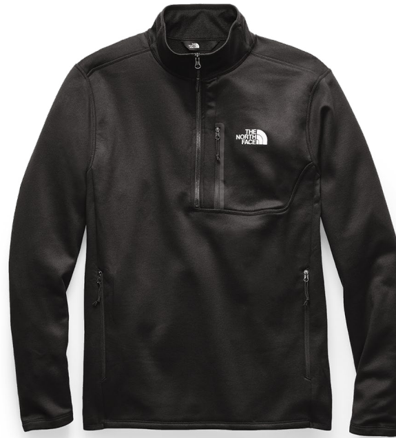
The North Face® Skyline 1/2-Zip Fleece Jacket NFOA7V63 Adult Sizes: S-3XL 3 colors