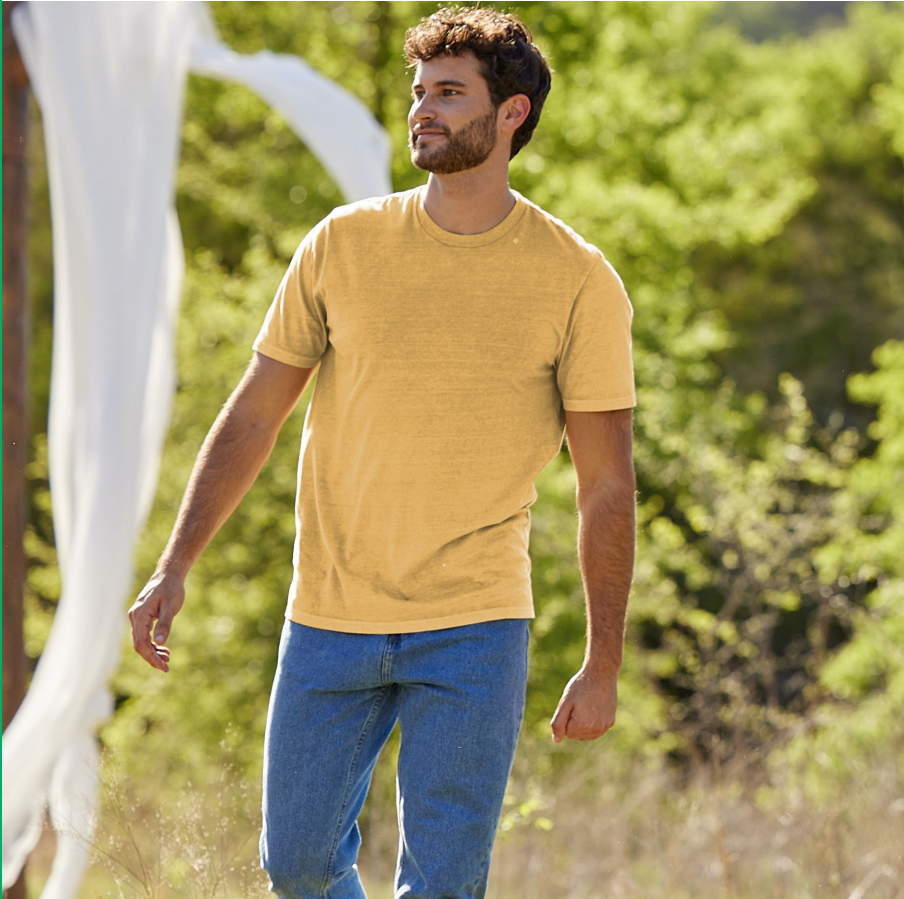
Allmade® Unisex Mineral Dye Organic Tee AL2400 | Unisex Sizes: XS-4XL | 4 Colors