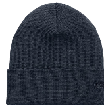
New Era® Recycled Cuff Beanie NE907 | One Size Fits Most | 3 colors