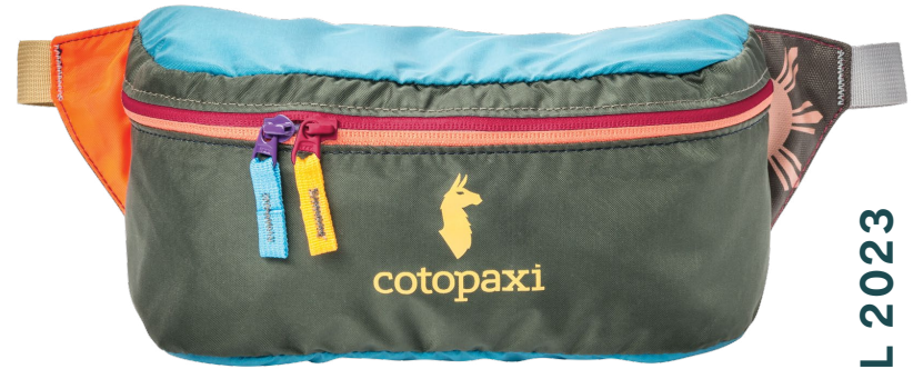
Cotopaxi Bataan Hip Pack COTOBFP | Color: Surprise