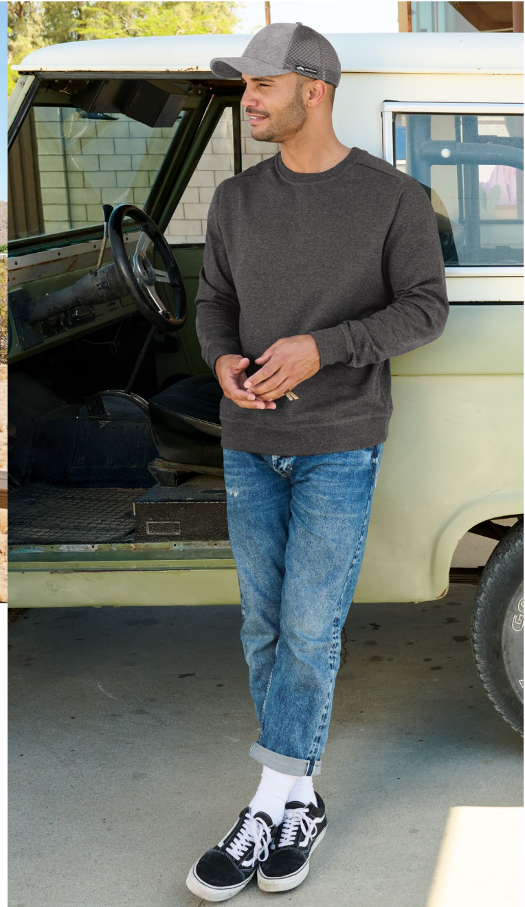
District® Re-Fleece™ Crew DT8104 | Adult Sizes: XS-4XL | 4 colors