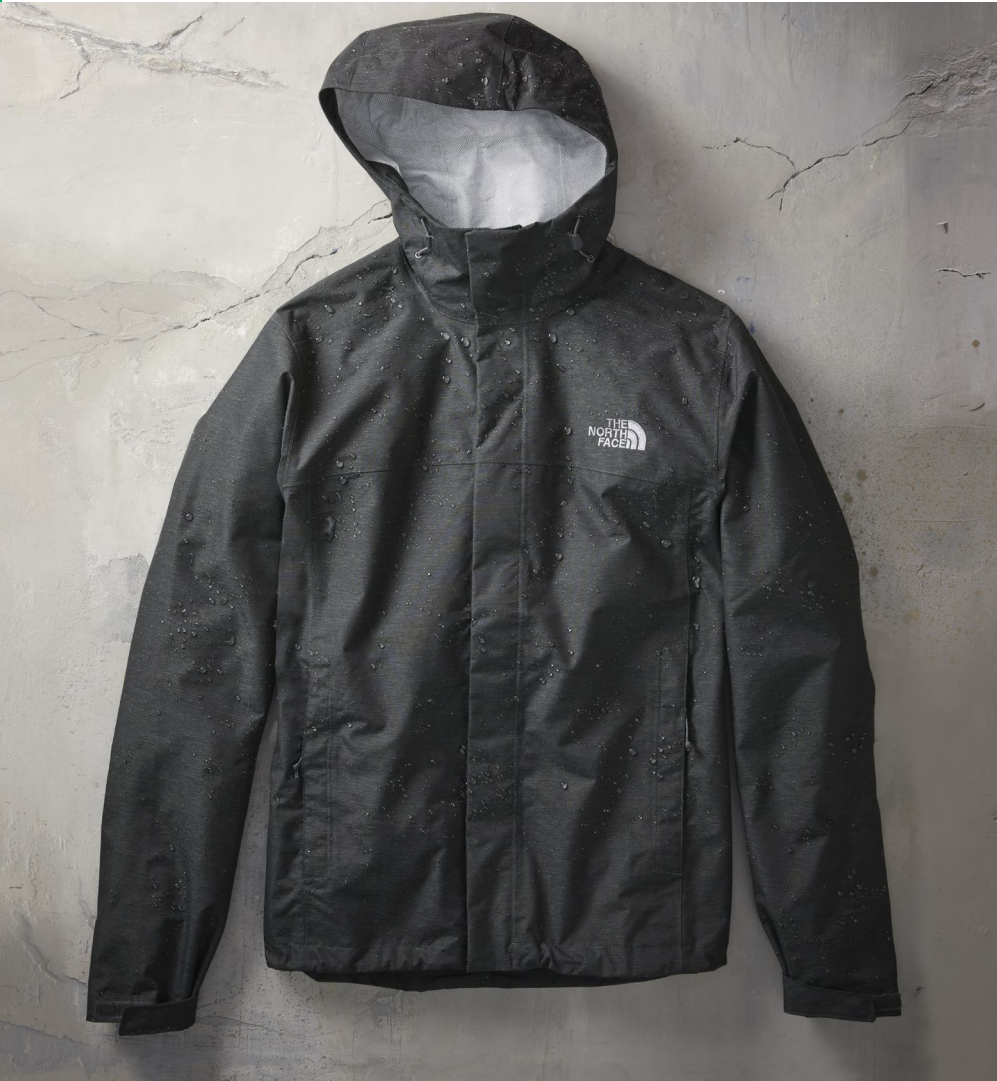
The North Face® DryVent™ Rain Jacket NFOA3LH4 | Adult Sizes: S-3XL | 4 colors