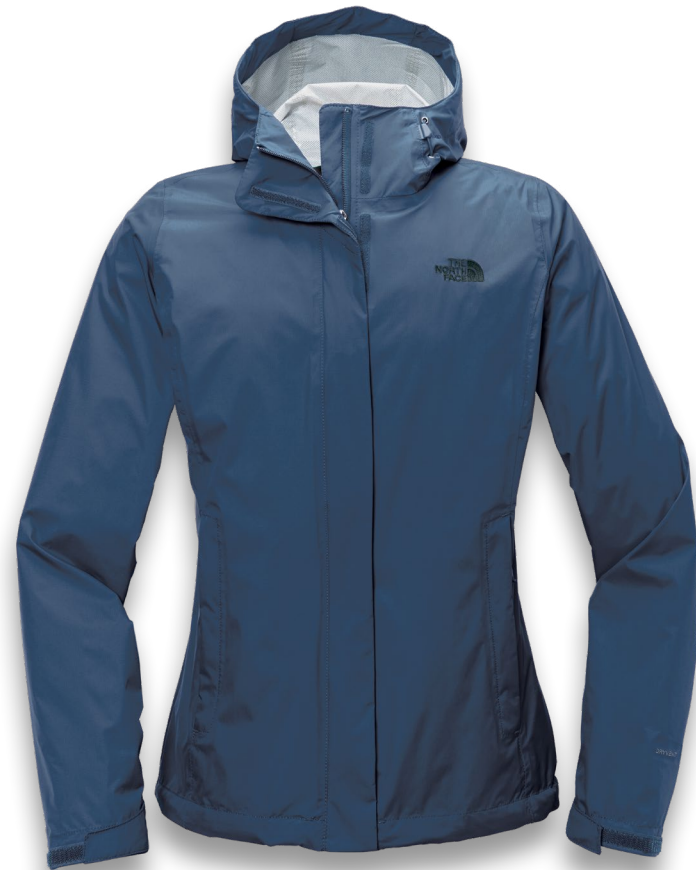
The North Face® Ladies DryVent™ Rain Jacket NFOA3LH5 | Ladies Sizes: S-2XL | 3 colors