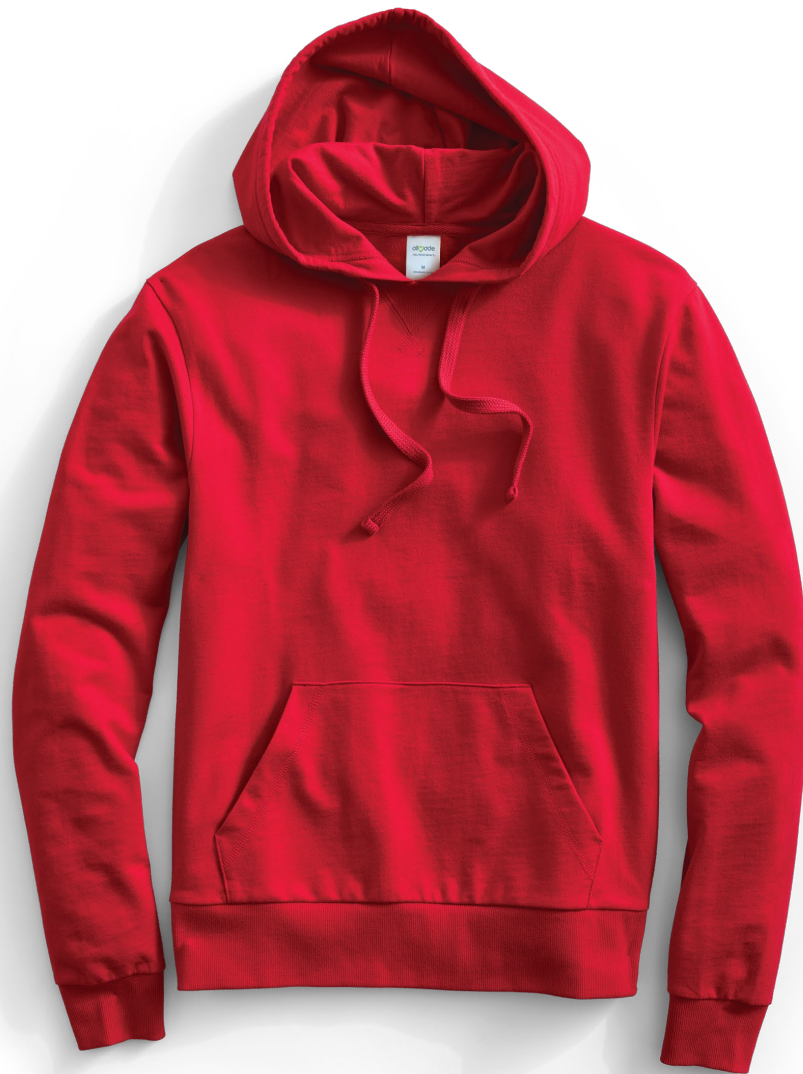
Allmade® Unisex Organic French Terry Pullover Hoodie AL4000 | Unisex Sizes: XS-4XL | 6 colors

Allmade French terry styles and cotton tees are made from 100% organic cotton fabric.