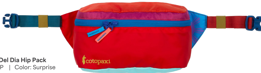
Cotopaxi Del Dia Hip Pack COTODDFP | Color: Surprise