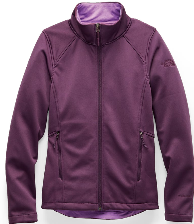
The North Face® Ladies Ridgewall Soft Shell Jacket NFOA3LGY | Ladies Sizes: S-2XL | 3 colors*