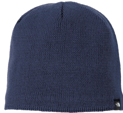
The North Face® Mountain Beanie NFOA4VUB | 10 colors