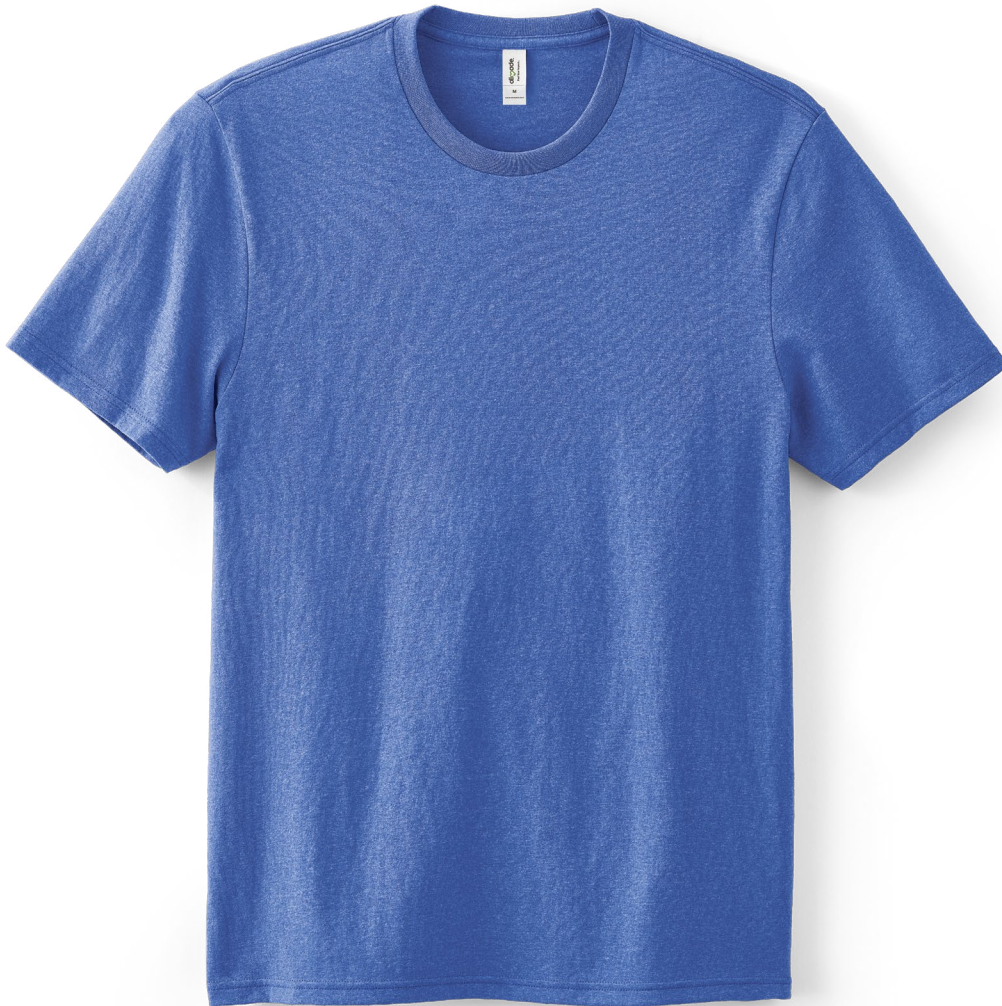
Allmade® Unisex Recycled Blend Tee AL2300 | Unisex Sizes: XS-4XL | 5 Colors