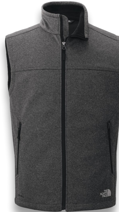
The North Face® Ridgewall Soft Shell Vest NFOA3LGZ Adult Sizes: S-3XL 2 colors