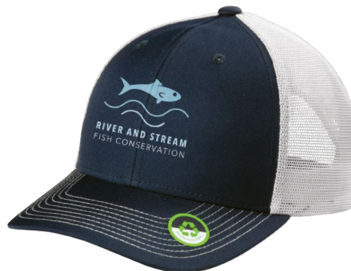
Port Authority® Eco Snapback Trucker Cap C112ECO | 5 colors