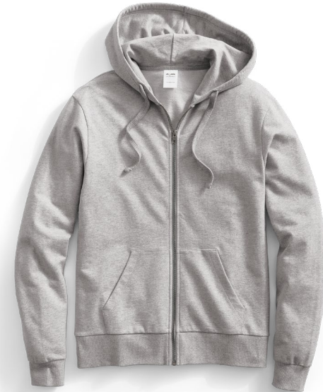
Allmade® Unisex Organic French Terry Full-Zip Hoodie AL4002 | Unisex Sizes: XS-4XL | 4 colors