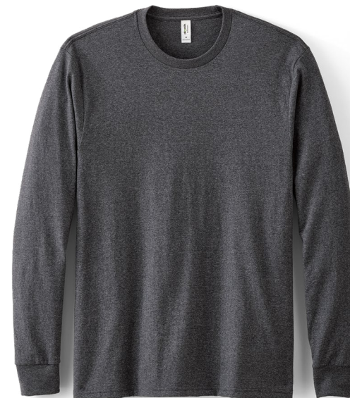
Allmade® Unisex Long Sleeve Recycled Blend Tee AL6204 | Unisex Sizes: XS-4XL | 4 Colors