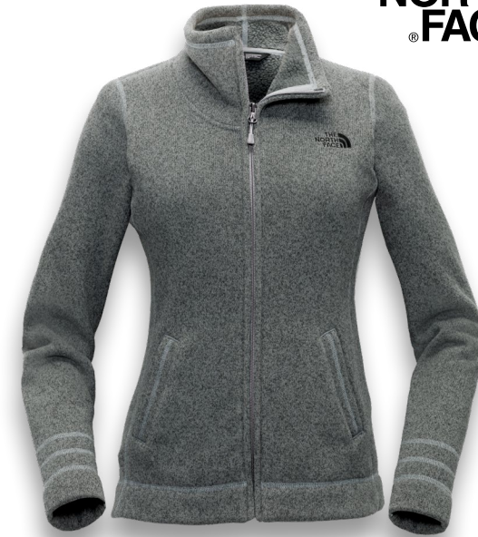
The North Face® Ladies Sweater Fleece Jacket NFOA3LH8 Ladies Sizes: S-2XL 2 Colors