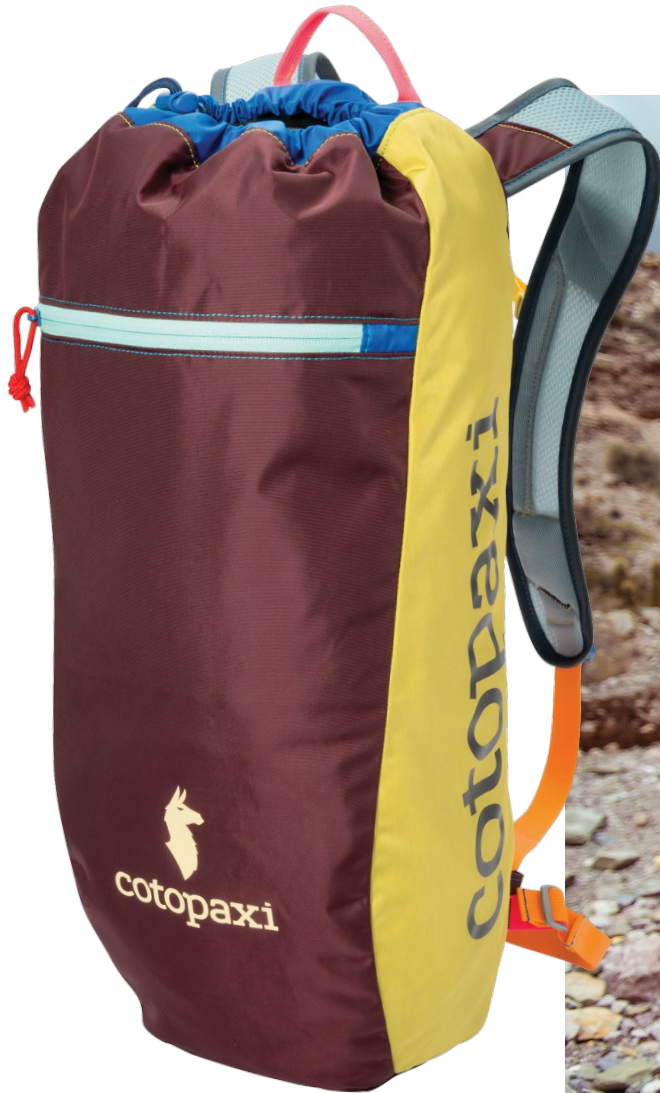
Cotopaxi Luzon Backpack COTOL18L | Color: Surprise

Each pack comes with a unique surprise color combination, made from a collection of fabric remnants.