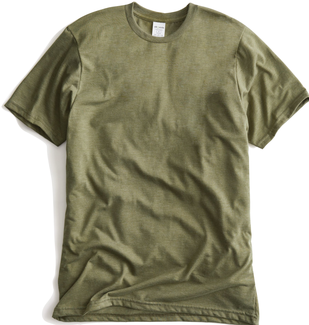
FREE Allmade® Unisex Tri-Blend Tee AL2004 | Unisex Sizes: XS-4XL | 22 colors

Feel your impact in these crazy-soft sustainable tees.