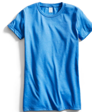
FREE Allmade® Youth Tri-Blend Tee AL207 | Youth Sizes: XS-XL | 10 colors