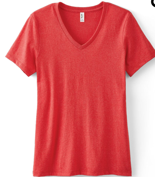
Allmade® Women's Recycled Blend V-Neck Tee AL2303 | Women's Sizes: XS-2XL | 5 Colors