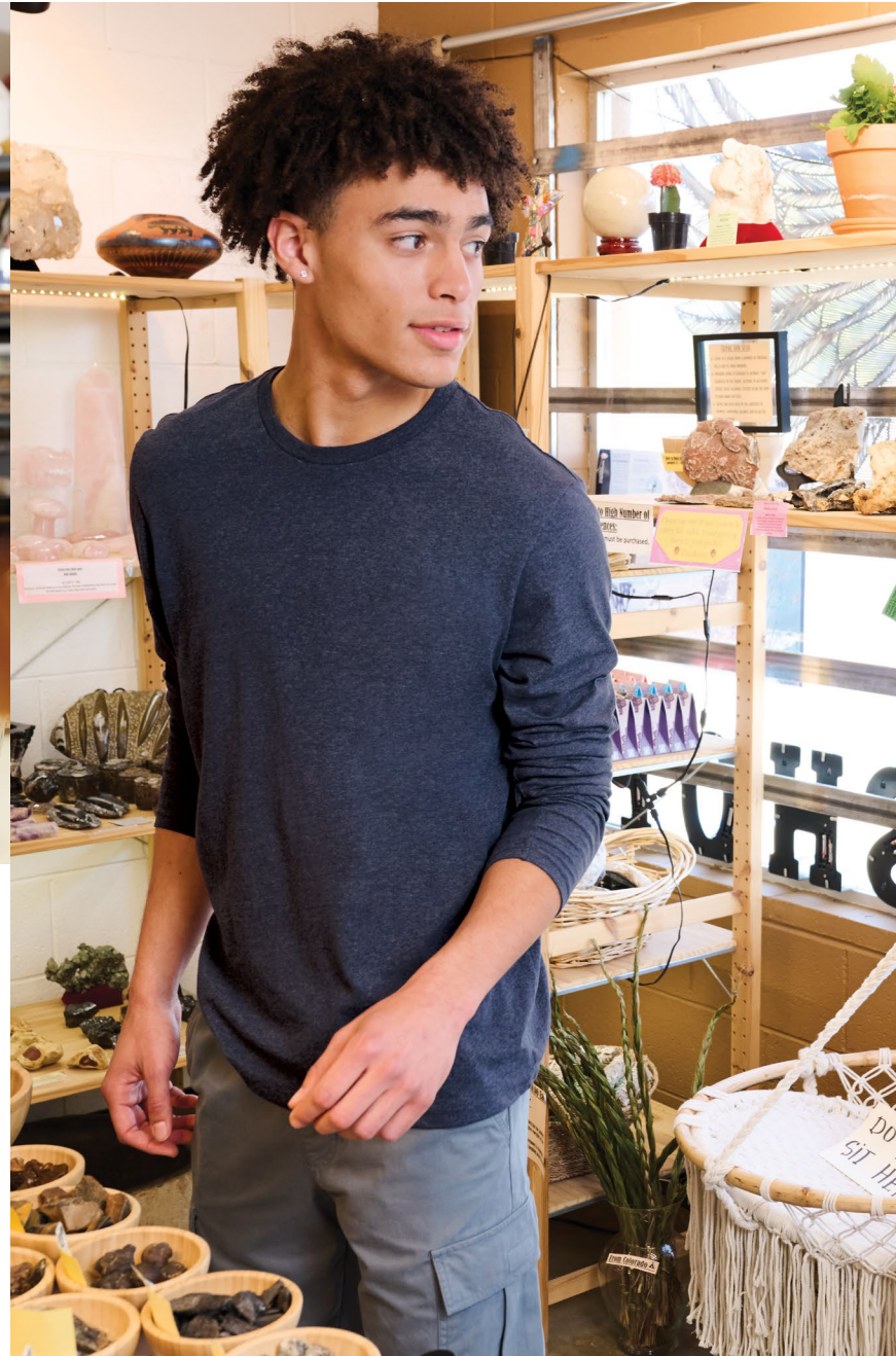
FREE District® Re-Tee® Long Sleeve DT8003 | Adult Sizes: XS-4XL | 5 colors