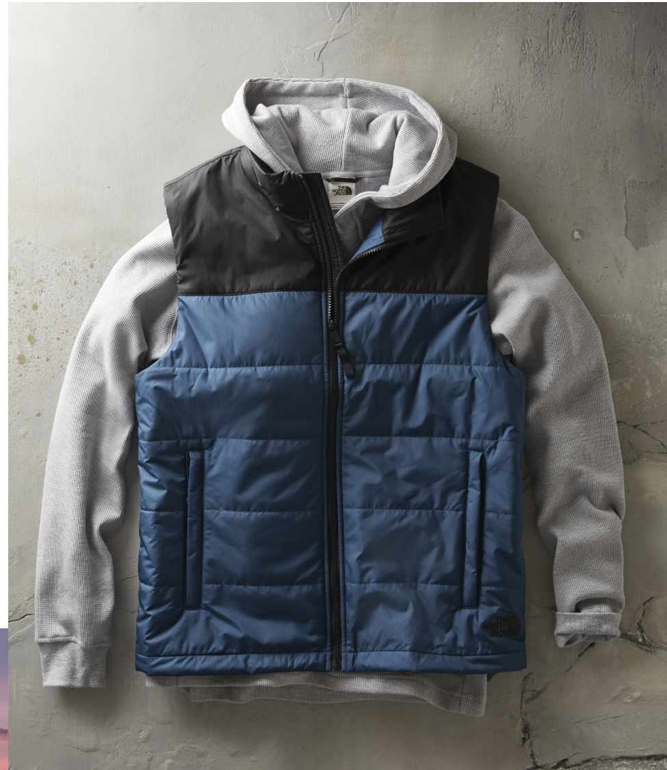
The North Face® Everyday Insulated Vest NFOA529A | Adult Sizes: S-3XL | 3 colors