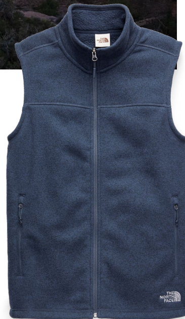
The North Face® Sweater Fleece Vest NFOA47FA Adult Sizes: S-3XL 3 Colors