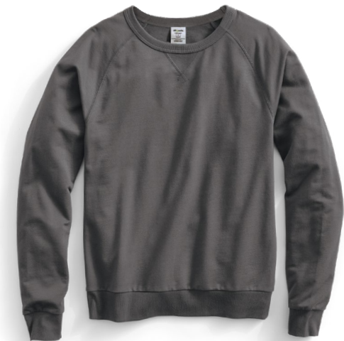
FREE Allmade® Unisex Organic French Terry Crewneck Sweatshirt AL4004 | Unisex Sizes: XS-4XL | 4 colors