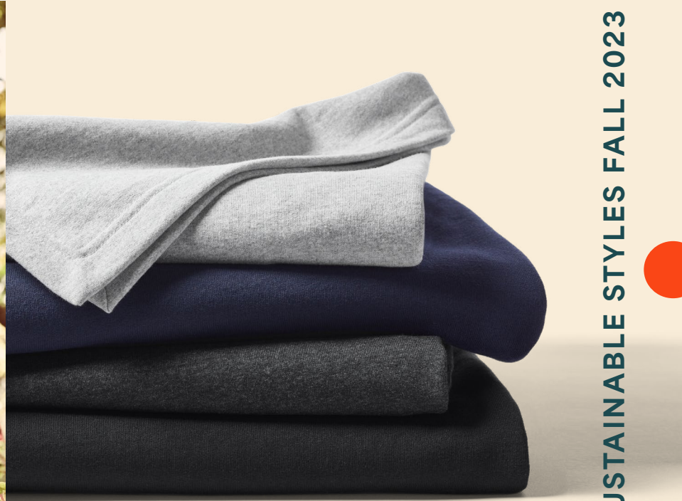
District® Re-Blanket™ DT81 | 4 colors