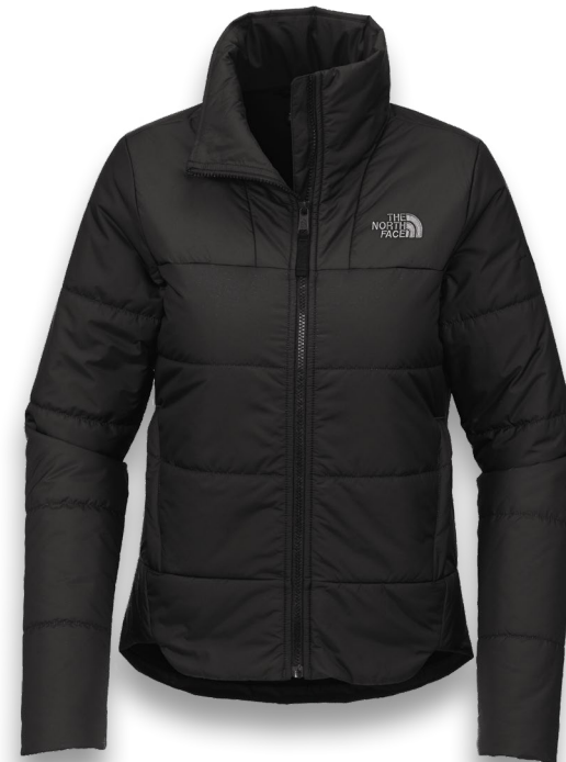
The North Face® Chest Logo Everyday Insulated Jacket NF0A7V6J | Adult Sizes: S-3XL | 3 colors