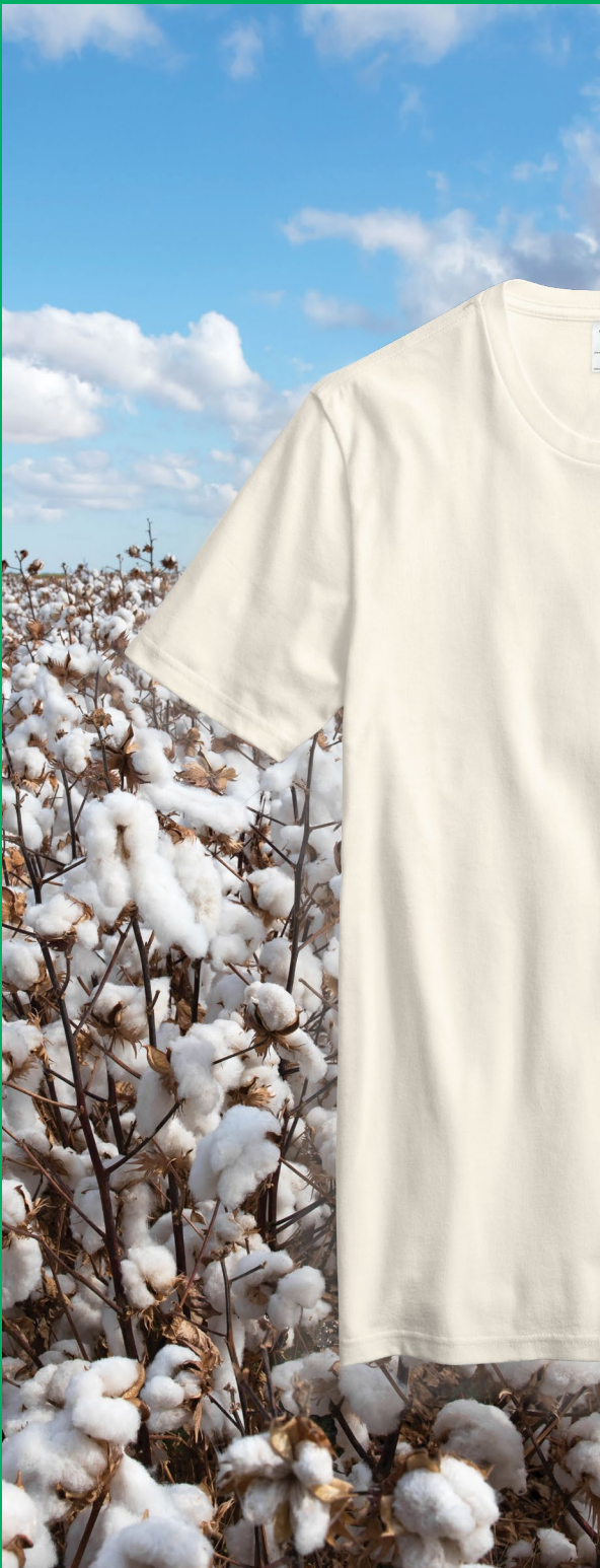
FREE Allmade® Unisex Organic Cotton Tee AL2100 | Unisex Sizes: XS-4XL | 8 colors