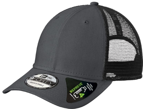
New Era® Recycled Snapback Cap NE208 | 5 colors