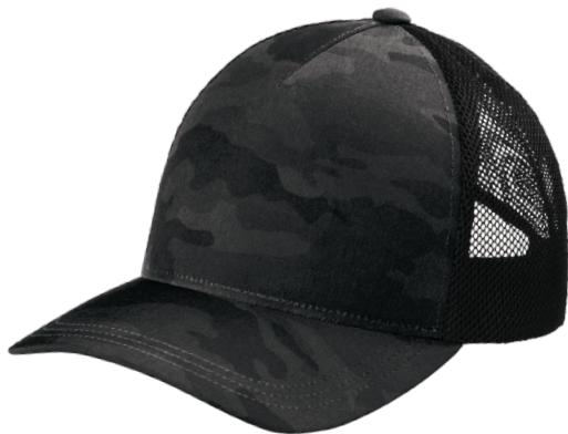
OGIO® Fusion Trucker Cap OG603 | One Size Fits Most | 3 colors