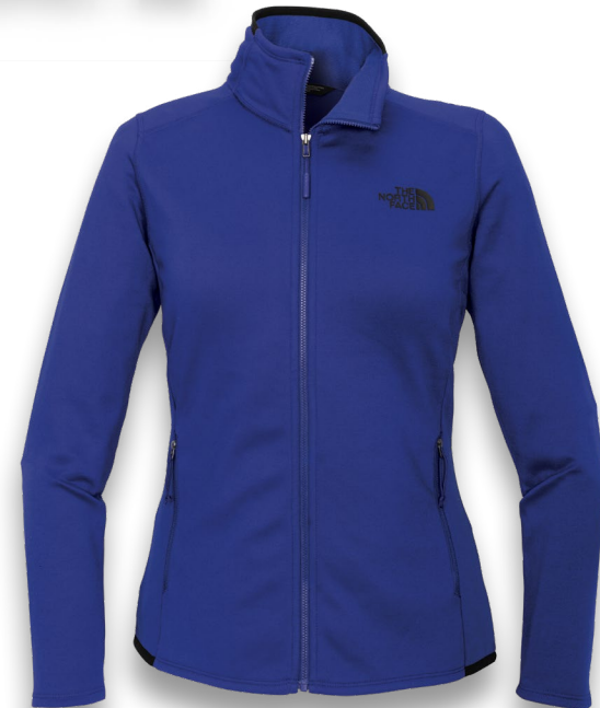
The North Face® Ladies Skyline Full-Zip Fleece Jacket NFOA7V62 | Ladies Sizes: S-2XL | 5 colors