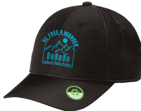
Port Authority® Eco Cap C954 | 4 colors