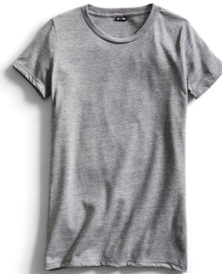
FREE Allmade® Women's Tri-Blend Tee AL2008 | Women's Sizes: XS-2XL | 12 colors