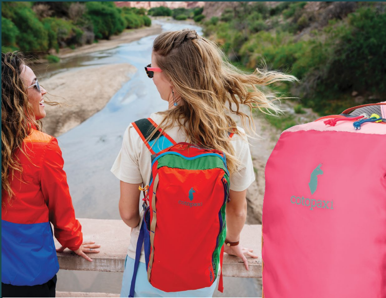
Cotopaxi Batac Backpack COTOBTP | Color: Surprise