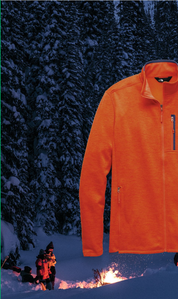
The North Face® Skyline Full-Zip Fleece Jacket NFOA7V64 | Adult Sizes: S-3XL | 5 colors